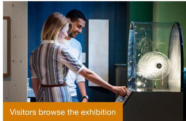
Visitors browse the exhibition