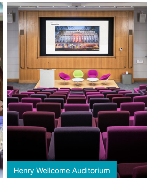
Henry Wellcome Auditorium