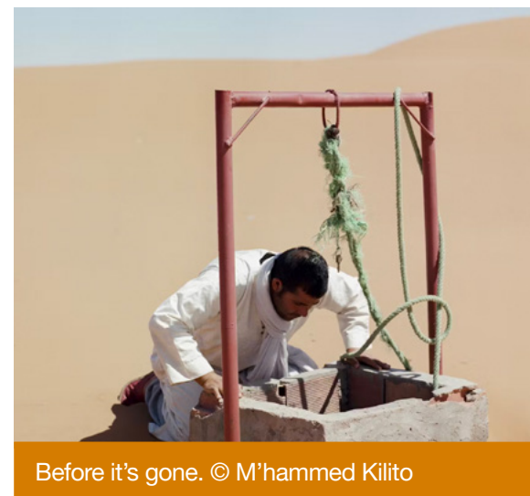
Before it's gone.

Thirst: In Search of Freshwater is a major exhibition exploring humanity's vital connection with freshwater, an essential source of life and health for living beings and land masses. Spanning ancient Mesopotamia, Victorian London, to modern-day Nepal and Singapore, it combines art, science, history, technology, and indigenous knowledge to deepen the understanding of our relationships with freshwater.