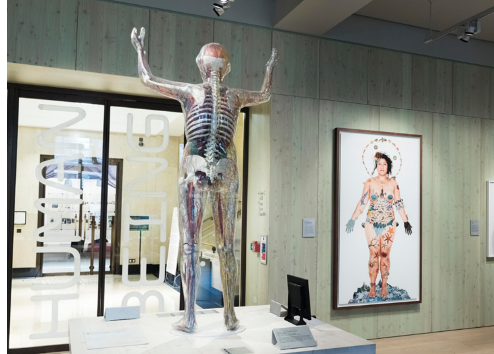
Being Human Gallery (artwork, right)

All venue hire profits are gifted to Wellcome, a global charitable foundation that supports science to solve urgent health challenges, with a focus on mental health, infectious disease, and climate and health.