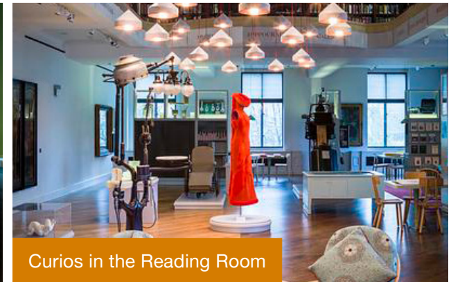
Curios in the Reading Room